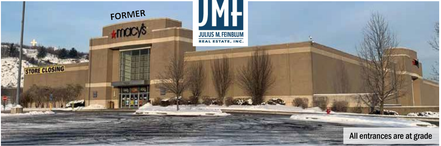
All entrances are at grade