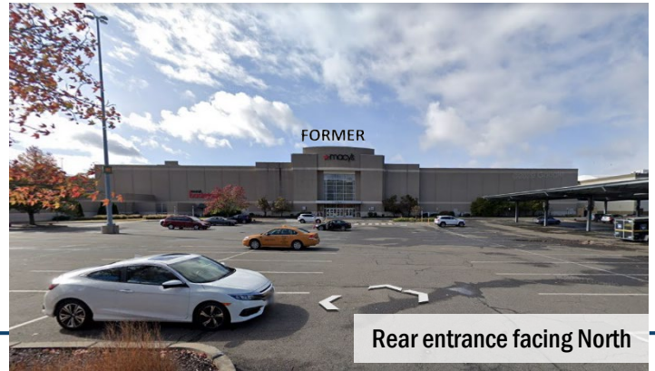
Rear entrance facing North