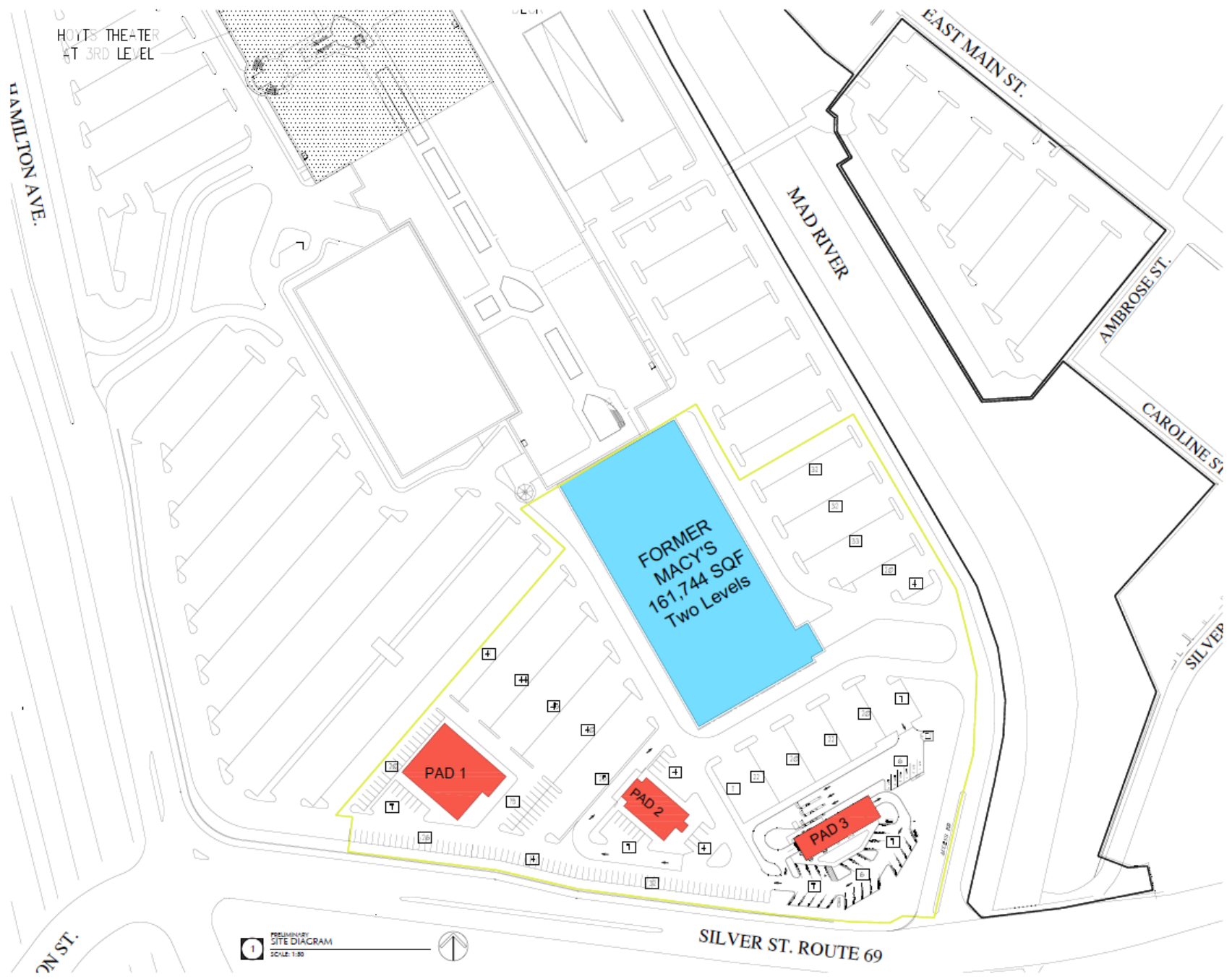
1 PRELIMINARY SITE DIAGRAM SCALE: 1/8" = 1'-0"