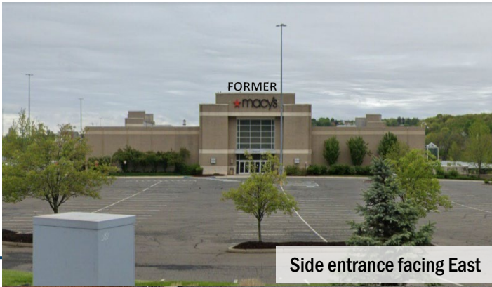
Side entrance facing East